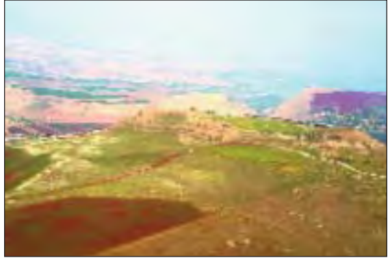
Horns of Hattin: Descent to Gennesaret

The view in this picture looks across an extinct volcano called the “ Horns of Hattin ” where, in 1187 A.D., Saladin handed the Crusaders their final defeat. The narrow valley leading to the Plain of Gennesaret (northwest shore of the Sea of Galilee), was also called the “Valley of the Robbers.” Bandits used to plunder caravans as they traveled up and down this strategic pass. Herod the Great (38 B.C.), for example, gathered a force at the village of Arbela to purge Galilee of the “robbers that were in the caves” above the pass (I Wars xvi.2-5). This was also the way of the