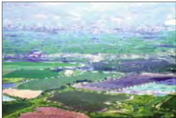
Lower Jordan Valley

This picture was taken south of Beit-Shean, and just south of the “narrowing” described in the introduction to this region. It shows all the major features of the Jordan Valley : the valley floor which is called the Ghor in Arabic, the winding Jordan River that flows through the “jungle” or “Swelling of the Jordan” called the Zor in Arabic, and the desolate area of eroded ridges and peaks that separates the Ghor from the Zor. The high mountain in the background is the Dome of Gilead, which is divided into halves by the Jabbok River (“half of Gilead” and the “river Jabbok” are mentioned in Josh. 12:2; the river valley of the Jabbok is just outside the upper left hand corner of this picture).