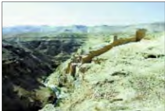
Monastery of Mar Saba, Judean Wilderness, Dead Sea

The Monastery of Mar Saba (bottom center) overlooks the canyon of Hanal Kidron (right center; see John 18:1), approximately 7 miles east of Bethlehem. The Kidron begins a mile north of Jerusalem's Temple Mount and descends through the wilderness over 20 miles to the Dead Sea. Mar Saba was founded by Saint Saba in 483 A.D. and was the center of Palestinian monasticism. The mountain-like appearance of the Judean Wilderness is due to the steep descent from the top of the hill country to the Jordan Valley, the low resistance of the chalky soil to erosion, and the relative imperviousness of the bedrock, which turns rainfall into a sudden rush of highly erosive runoff ("Terrors overtake him like a flood; in the night a whirlwind carries him off"; Job 27:20). At the end of the Bar Kochba revolt (131-135 A.D.), the supporters of Bar Kochba hid in caves in the cliffs of the canyons that descend to the Dead Sea . Unable to assault the caves directly, the Romans set up camps to prevent the rebels from escaping. Except for a few small settlements and forts, the Judean Wilderness did not have any permanent settlements.