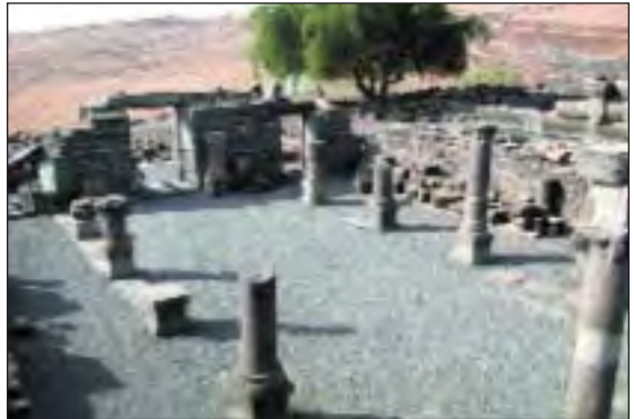
Chorazim (Kh. Kerraza)

Chorazim is located 2 miles north of Capernaum. It was one of the cities reproached by Jesus for its disbelief (Matt. 11:20-24). The excavation of Chorazim uncovered a synagogue of the Galilean type, located in the center of town. It was built of the local black basalt, common to the Galilee and Golan regions, and measures about 70 feet by 50 feet. The entrance to the synagogue faces south towards Jerusalem. The Bible records that “[Jesus] went about all Galilee, teaching in their synagogues and preaching the gospel of the kingdom and healing every disease and every infirmity among the people” (Matt. 4:23).