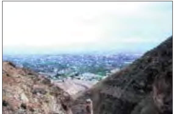
Mount of Temptation and Jericho

Across the Jordan from Jericho are the mountains of Moab and the “plains of Moab” (north of the Dead Sea), where the children of Israel pitched their tents “beyond the Jordan at Jericho” (Numb. 22:1). The next picture overlooks the oasis of Jericho and was taken from the Mount of Temptation , the traditional “high mountain” from which Satan showed Jesus “all the kingdoms of the world and the glory of them” (Matt. 4:8). These mountain cliffs mark the beginning of the Judean Wilderness, the eastern frontier of Judah. The oasis of Jericho is the green area in the center of the picture. The men of ancient Jericho searched for Joshua’s spies along the road that led from Jericho to “the fords” of the Jordan River (Josh. 2:1-7).