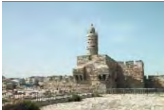
Citadel and Jaffa Gate

The original structure of the Citadel (or fortress) in the center of the next picture was built by Herod the Great. It had three towers, which Herod named after his brother, Phasael; his friend, Hippicus; and his wife, Mariamne (Herod had Mariamne executed after he suspected that she was involved in some treachery against him). Some of the original stones used to build the tower named after Phasael can still be seen in the Citadel today. (The walls of the present Citadel were built by Suleiman the Magnificent in 1540 A.D.) Today, there is a magnificent museum inside the Citadel that depicts Jerusalem through the ages. To the left (north) of the Citadel is Jaffa Gate , where the road from Jerusalem to the port of Jaffa on the Mediterranean Sea begins.