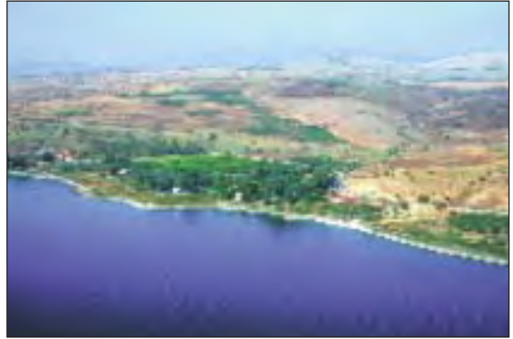
Tabgha: Multiplication of “loaves and fishes”

Early Christian tradition places the Multiplication of “loaves and fishes” near the sea on a spot known in Greek as Heptapegon, “Seven Wells,” which has been shortened to Tabgha . When Jesus saw the great multitude that had “followed him on foot out of the towns, he had compassion on them, and healed their sick.” There is an altar inside the CHURCH OF THE MULTIPLICATION OF BREAD, on which Jesus is said to have placed five loaves and two fishes. From these he fed “about five thousand men, beside women and children” (Matt. 14:13-21). Behind the altar of the church is a beautiful mosaic which shows a basket containing four loaves of bread, and two lake fish, one on either side of the basket. A short distance away, by the shore, is the CHURCH OF THE PRIMACY, where, by tradition, Peter received the commission from Jesus; “Feed my lambs ... Feed my sheep” (John 21:15-17).