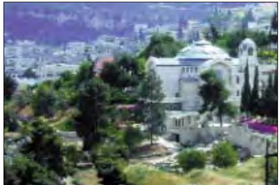
St. Peter's Church (Palace of Caiaphas)

South of the Old City wall, on the eastern slope of a hill that overlooks the area of Old Testament Jerusalem, is the Church of St. Peter in Gallicantu . The church was built in 1931 and is the traditional site of the Palace of Caiaphas, who was the high priest in Jerusalem at the time of Jesus’ arrest and crucifixion. Under the church is a cave thought to be where Jesus was detained by the chief priests. Here they “struck him; and some slapped him, saying, ‘Prophecy to us, you Christ! Who is it that struck you?’” In this setting outside the palace, Peter denied knowing Jesus three times: “And Peter remembered the saying of Jesus, ‘Before the cock crows, you will deny me three times.’ And he went out and wept bitterly” (Matt. 26:57-75).