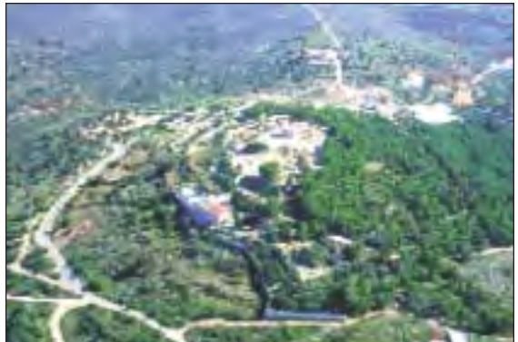
Turan Valley: Sepphoris

The Turan Valley is just north of the mountains of Nazareth. The valley carried the most important highway through Lower Galilee, connecting the port city of Acco/Ptolemais with the Sea of Galilee and Jordan Valley. According to tradition, the incident of Jesus’ disciples plucking ears of corn on the Sabbath took place in this valley (see Matt. 12:1-8). In the foreground are the ruins of Sepphoris , an important city of Lower Galilee. It was located 5 miles northwest of Nazareth. Herod Antipas “built a wall about Sepphoris” and made it the capital of Galilee before he moved the capital to Tiberias (XVIII Ant. ii.1). The mostly Jewish population of Sepphoris supported the Romans in the First Jewish Revolt (66-73 A.D.).