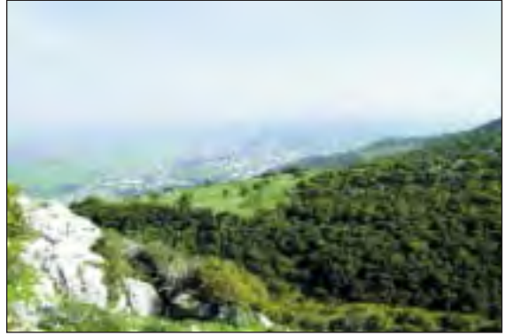
Mount Carmel and Jezreel Valley

Since ancient times, Mount Carmel has been considered a holy mountain. In Egyptian documents dating from the 18th and 19th dynasties (ca. 1567-1200 B.C.), Mt. Carmel is called Rosh Kadesh , or the “Holy Cape.” The Bible describes the beauty and fertility of Mount Carmel as the “majesty of Carmel” and compares its fertility to Lebanon, Bashan, Gilead, and the Plain of Sharon (Isa. 35:2; Jer. 50:19). The monastery of Elijah overlooks the western section of the Jezreel Valley (upper left). Mt. Carmel is the traditional site of Elijah’s contest with the priests of Baal, where “the fire of the Lord fell, and consumed the burnt offering,” and the people cried, “The Lord, he is God.” After the contest, Elijah brought the priests of Baal “down to the brook Kishon [in the valley], and killed them there” (1 Kgs. 18:38-40).