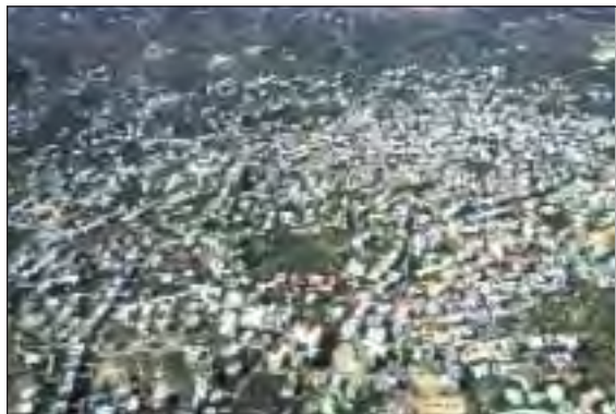
Cana of Galilee (Kefar Kana)

Cana of Galilee was the home of Nathanael, the same who inquired of Philip, “Can anything good come out of Nazareth?” (John 1:46). When Jesus saw Nathanael coming to meet him, he said; “Behold an Israelite indeed, in whom is no guile!” (John 1:47; 21:2). In this same Cana of Galilee, Jesus performed his first public miracle by changing water into wine at the wedding feast: “And [Jesus] manifested his glory; and his disciples believed in him” (John 2:1-11). Later from Cana, Jesus healed the nobleman’s son, who was sick in Capernaum (John 4:46-54). Kefar Kana , pictured here,