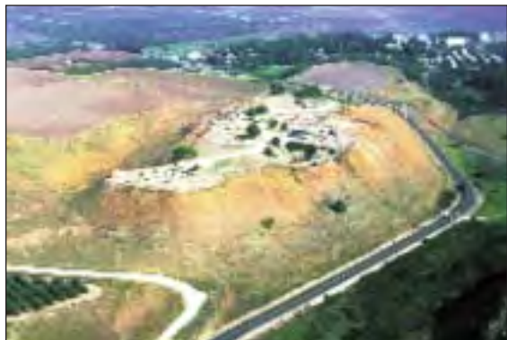
Hazor (Tell el-Qidah)

Hazor was a large Canaanite and Israelite city. The site consists of the mound (center) and the lower part of the city just north of the mound (upper left). Together they cover about 200 acres. Hazor is mentioned in the Execration Texts and in other early Egyptian documents. The Execration Texts date to the 20th and 19th centuries B.C. and provide the most important information about Palestine from that period. Hazor is also mentioned in the Mari archives, where it appears as a major trade center for merchant caravans traveling to and from Babylon. In the Bible, Hazor is mentioned in connection with the Israelite conquest of northern Canaan and in the story of Deborah and Barak (Josh. 11:10-13; Judg. 4:2). Hazor was also a fortified city of King Solomon (1 Kgs. 9:15). One of the important discoveries at Hazor was its water supply system, which dates to the period of Ahab, king of Israel, or the 9th century B.C.