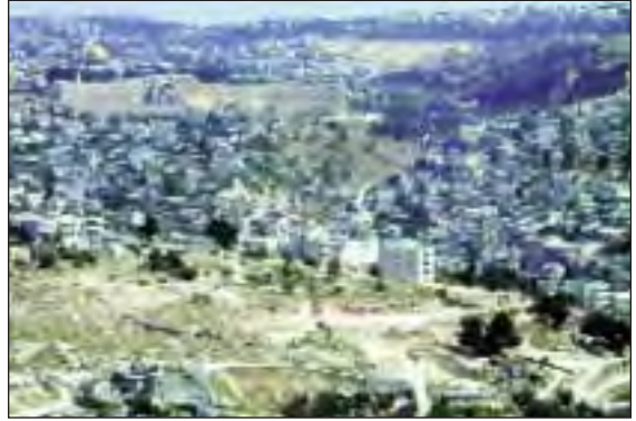
Jerusalem: City of David

The pictures on this page show some key sites in and around Jerusalem representing various periods of history. First is the City of David , which was located on the hill (center) below the Temple Mount, opposite the village of Silwan (middle right). The end of Hezekiah's tunnel (2 Chron. 32:2-4, 30) and the Pool of Siloam (John 9:7-11) are located at the southern end of the City of David, where the Tyropoeon and Kidron Valleys meet to form a "V" (bottom right). The present day wall of Jerusalem's Old City was built in 1542 A.D., during the reign of Sultan Suleiman. Inside the southern gate, called Dung Gate, is the Western Wall of the Temple Mount built by Herod the Great. The Western Wall is sacred to Jews, because, as part of the original wall surrounding the Temple Mount, it is the closest place to their ancient temple. East of the Temple Mount is the Kidron Valley and the Mount of Olives (see the next section on Jerusalem, p. 31).