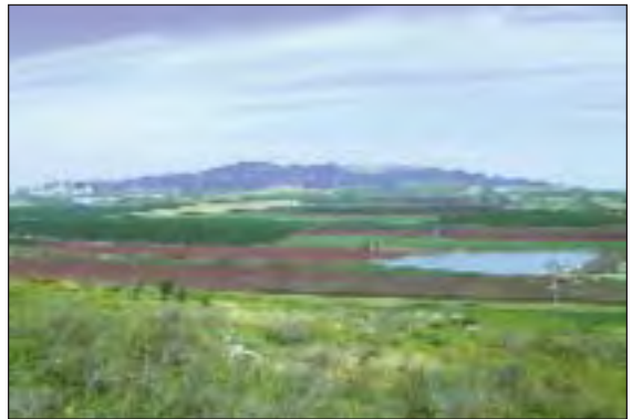
Hill of Moreh

The Hill of Moreh is where Gideon and 300 men defeated the Midianites. As Gideon’s men descended the hill they cried, “A sword for the Lord and for Gideon!” (Judg. 7:1, 20). They chased the Midianites east toward the Jordan Valley and Gilead (Transjordan). South of the Hill of Moreh was the biblical city of Shunem where the Philistines gathered to fight King Saul whose army was at Mount Gilboa (1 Sam. 28:4; 31). Shunem was also the town in which Elisha raised the widow’s son from the dead (2 Kgs. 4:8-37).