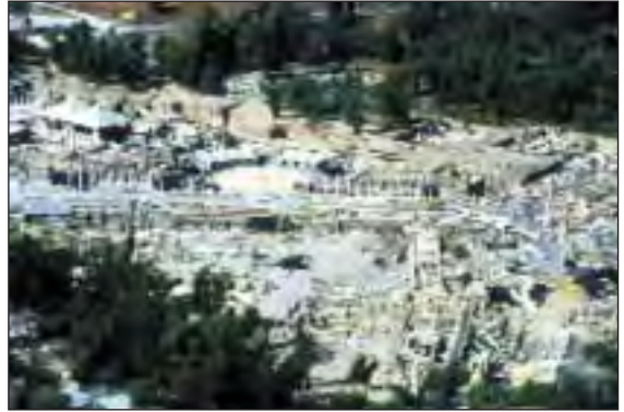
Beit-Shean (Tell el-Husn)

The site of Beit-Shean lies in the middle of the valley, approximately 400 feet below sea level. It guarded the eastern entrance to the Jezreel Valley and the main highway that crossed the Jordan at the fords south of the Sea of Galilee. Six Egyptian temples have been discovered at Beit-Shean, ranging from the 14th to the 11th centuries B.C. Beit-Shean is also mentioned in Egyptian