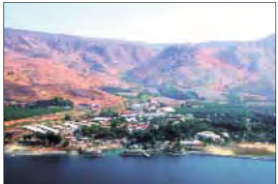
Hippus, Kursi: Country of the Gergesenes

The view in the next picture shows the eastern shore of the Sea of Galilee. In the center of the picture is an isolated hill which slopes toward the lake. This is the site of ancient Hippus . In 63 B.C., the Roman general Pompey made Hippus a member of the Decapolis, a district with a mixed population dominated by Greeks. The mountains in this picture marked the start of the Golan Region. The village of Kursi was at the point where the road leading up to Golan meets the shore road. According to an early Christian tradition, this was the place where Jesus caused certain demons to enter the bodies of pigs grazing on a nearby hill (see Matt. 8:28-34; Luke 8:26-39). A short distance south of Kursi is the only spot along the eastern shore where the mountains reach to the lake. A Byzantine church was built at Kursi in the middle of the 5th century A.D. to identify this spot as the place of the miracle.