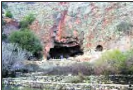
Caesarea Philippi: Grotto of Pan

Ancient Caesarea Philippi was located near one of the main sources of the Jordan River at the foot of Mount Hermon. The original name was Panias, after the Greek god Pan (the modern name Banias is an Arabic corruption of Panias). In 20 B.C., the city was granted to Herod the Great by the Roman Emperor, Caesar Augustus. Herod built a magnificent temple to Augustus near the grotto of Pan. He also changed the name of the city to Caesarea in honor of Augustus (see Luke 1:1). Herod's son, Philip, enlarged the city and changed the name to Caesarea Philippi, "Now when Jesus came into the district of Caesarea Philippi, he asked his disciples, Who do men say that the Son of man is?" Peter answered for the disciples, declaring, "You are the Christ, the Son of the living God" (Matt. 16:13-20).