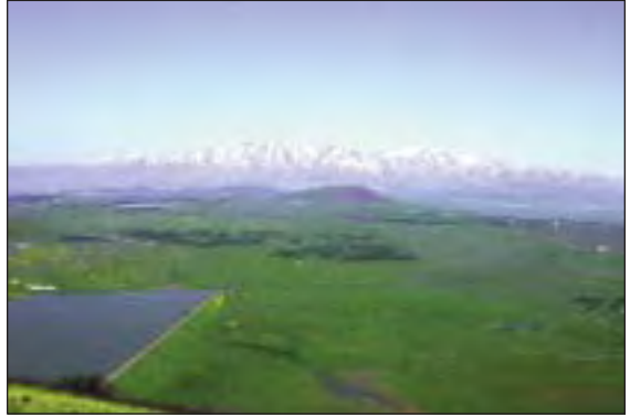
Mount Hermon and Upper Jordan Valley

Mount Hermon comes into view as you leave the region around the Sea of Galilee and head north. Mount Hermon rises approximately 9,230 feet above sea level. Its majestic, often snow-capped peaks can be seen from many parts of Palestine. During the hot summer months the farmers of Palestine must look longingly toward Mount Hermon. The mountain looks down upon the Old Testament region of Bashan to the south and east, the Upper Jordan Valley to the south, and the “valley of Lebanon” (the Beq’a of modern Lebanon) to the west (Josh. 11:17). The water that falls on Mount Hermon in the form of dew, rain, and snow feeds the springs that form the headwaters of the Jordan River. The dew of Mount Hermon was a sign of blessing, even “life for evermore” (Ps. 133:3). In biblical times, Mount Hermon was thickly forested and was the home of lions and leopards (Song. 4:8). The region of Bashan south of Mount Hermon was well-known for its rich pasture lands that supported the “fatlings of Bashan” (Ezek. 39:18).