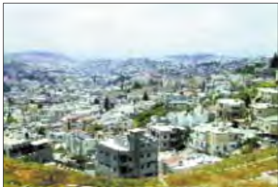
Nazareth and Hill of Moreh

Nazareth was the home of Joseph and Mary, as well as the town in which Jesus grew up. In his day, it was a small agricultural village with about 2,000 inhabitants. When Philip said to Nathanael, “We have found him, of whom ... the prophets wrote, Jesus of Nazareth,” Nathanael promptly asked of Philip, “Can anything good come out of Nazareth?” (John 1:45-56). Nazareth itself was small, but its position between two international highways gave it a good view of the ancient world. To the south was the Jezreel Valley where many events from Israelite history took place. Through this valley passed the merchants, as well as the armies of Rome (see p. 10, Bible Study - Lower Galilee ).