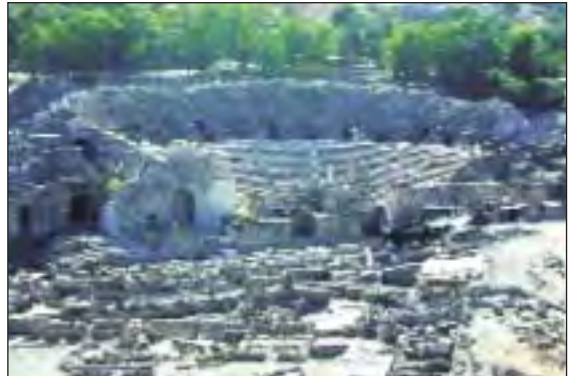
Beit-Shean (Scythopolis): Roman Theater

is one of the best preserved Roman theaters in Palestine. Elaborately decorated, it had a seating capacity of some 8,000. It is similar to one built by Herod the Great at Caesarea on the coast of Palestine. Much excavation is going on at Beit-Shean today. Several teams are working year round to uncover and then restore significant parts of the ancient site. Today the visitor to Beit-Shean can see public buildings, columns, streets and other ruins from the Roman and Byzantine periods.