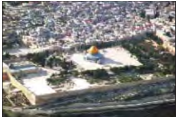
Temple Mount: Dome of the Rock

The Temple Mount , called Mount Moriah in the Bible (2 Chron. 3:1), was the site of the temples of Solomon, Zerubbabel, and Herod. It is also a holy place to Moslems, who believe that Mohammed went to heaven from this spot. The Dome of the Rock was built between 687 and 691 A.D. and is decorated with beautiful Persian tiles. To Moslems the world over, it is next to Mecca and Medina in importance. The silver-domed Al-Aqsa mosque was built between 709 and 715 A.D. and can hold about 5,000 worshippers. North of the Temple Mount was Pilate's Judgment Hall where Jesus was condemned (Matt. 27:2-31). This place marks the beginning of the Via Dolorosa , the traditional path Jesus took to Calvary.