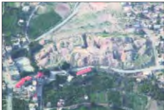
Old Testament Jericho (Tell es-Sultan)

Joshua’s Jericho was probably a small city, with mud brick walls that have long since disintegrated by both wind and rain. The site is 6 miles north of the Dead Sea and 2 miles north of the site of New Testament Jericho. The later city was built up by Herod the Great and was the city Jesus passed through while traveling to and from Jerusalem. The spring of Jericho is in the stand of trees across the road from the mound. These were the waters purified by the prophet Elisha, “so the water has been wholesome to this day” (2 Kgs. 2:13, 19-22).