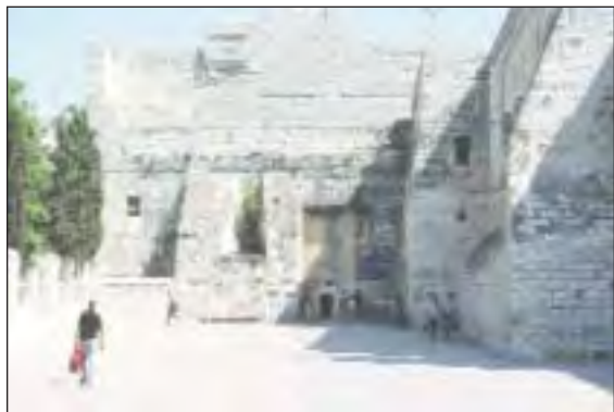
Bethlehem: Church of the Nativity

It has been said that the name “Bethlehem” stirs the heart of every Christian throughout the world. Micah prophesied that it would be the birthplace of Jesus of Nazareth: “But you, O Beth-lehem Ephrathah, who are little to be among the clans of Judah, from you shall come forth for me one who is to be ruler in Israel” (Micah 5:2). We also remember the stories of Ruth and Boaz (Ruth 2-4) and of David protecting his father’s flocks from the lion and the bear (1 Sam. 17:34-35). But it is the image of “shepherds out in the field, keeping watch over their flock” that at Christmas time works its magic, and of an angel standing above the shepherds saying: “For to you is born this day in the city of David a Savior, who is Christ the Lord” (Luke 2:8-12). The site of the manger is said to be in a cave below the Church of the Nativity , which dates to the 6th century A.D. The original church was constructed by Constantine (ca. 326 A.D.) after the site was identified by his mother Helena.