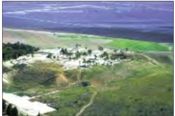
Megiddo and Jezreel Valley

The Jezreel Valley has been the focus of many conflicts. It has been called the battlefield of nations, and prophets predicted that it would be the place where nations would assemble for the final conflict taking place at the coming of the Messiah, “at the place which is called in Hebrew Armageddon” (Rev. 16:14-21). Megiddo is first mentioned in the annals of Thutmose III, king of Egypt, who defeated a Canaanite coalition here in 1468 B.C. According to Thutmose, “capturing Megiddo is as good as capturing a thousand cities.” The reason was Megiddo’s strategic location at one of the key entrances to the Jezreel Valley. Megiddo was fortified by King Solomon in the 10th century B.C. (1 Kgs. 9:15), and was the site of a battle in which King Josiah was killed by the army of Pharaoh Necho in 609 B.C.