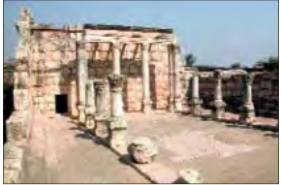
Synagogue in Capernaum

The first picture on this page shows the ancient synagogue at Capernaum . This particular synagogue was built in the 3rd to 4th century A.D. but reminds us of the synagogue in Capernaum built by the Roman officer for the Jews in Jesus' day (see Luke 7:1-5). Capernaum is located on the northern shore of the Sea of Galilee, about 2.5 miles from the mouth of the Jordan River. It was one of the busiest towns in Galilee and the center of Jesus' Galilean ministry (Mark 1:21; 3:1; Luke 4:31-38; John 2:11-12). In the Gospels, Capernaum is called "his own city" after Jesus withdrew from Nazareth (Matt. 4:12-17; 9:1). Here in the synagogue of Capernaum, Jesus taught: "I am the bread of life; he who comes to me shall not hunger, and he who believes in me shall never thirst" (John 6:35).