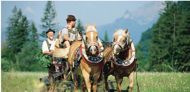
Tour: OA22 Code: A