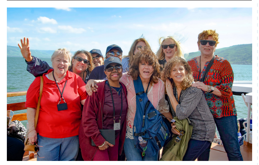
Tour = TH25 Code = G