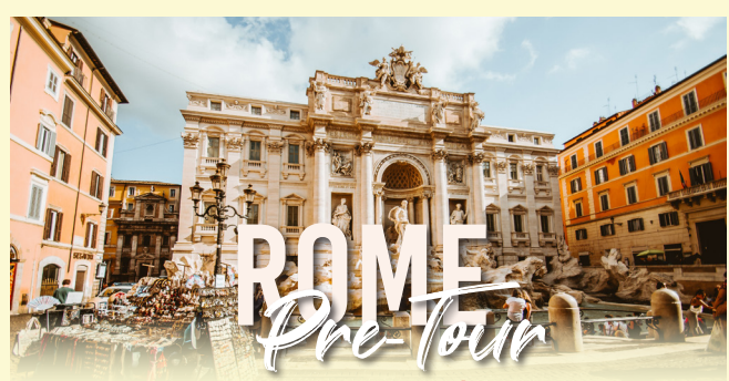
SEPTEMBER 19 - 22, 2024 | FOR $1,198*

Year: a Journey through Scripture in 365 Days, and Questions Jesus Asked: A Six-Week Study in the Gospels, both by Abingdon Press. He has been the featured speaker and workshop presenter at conferences across the country, and is the proud father of two college-aged children, who share his love for reading, Marvel movies, and live theater.