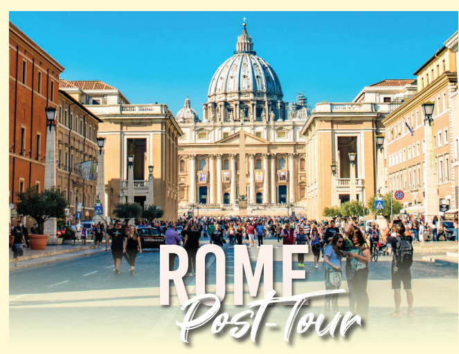
OCTOBER 1 - 3, 2024 | FOR $1,198*

Fuel Surcharges and Government Taxes (Subject to change) Shore Excursions as listed on itinerary • Most Meals Admin. Fees • Port Charges • Cruise Taxes