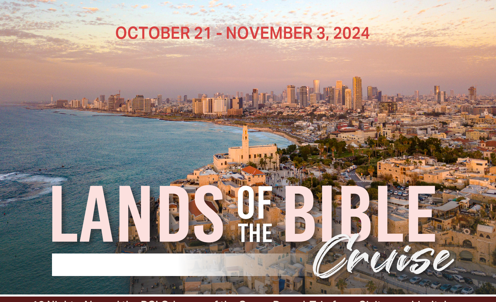
12 Nights Aboard the RCI Odyssey of the Seas • Round-Trip from Civitavecchia, Italy