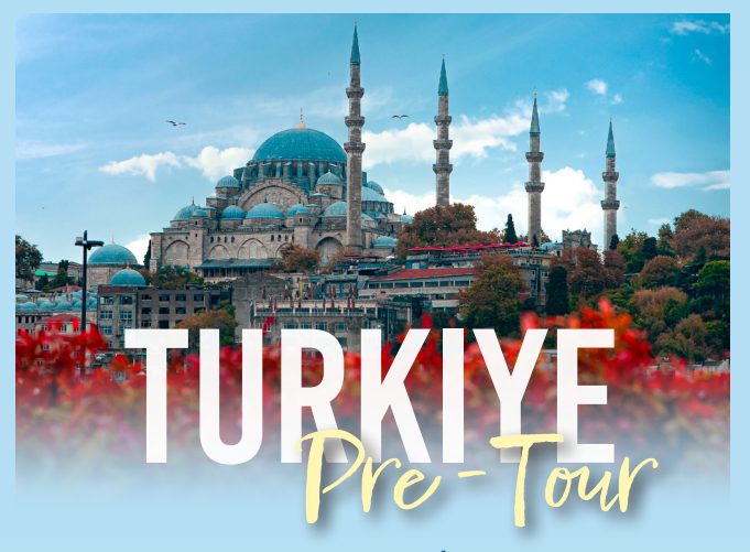
AUGUST 26 - 31, 2025 | FOR $1,798*